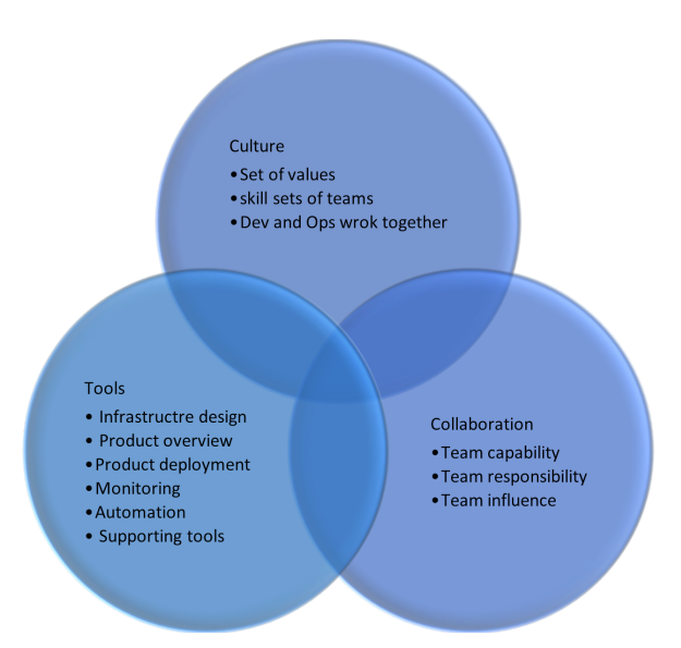
Fig. 1. DevOps definition overview (adapted from [29]).

According to Macarthy and Bass [25] there are two conflicting views of DevOps. They suggested that DevOps is an organizational culture that is used to facilitate and increase software development processes rapidly. The second view suggested that DevOps is a job description lens that requires both skills for software professionals like development skills and operations IT skills for successful execution of job duties. Based on these two views of DevOps practices, we can say that DevOps is not about the automation process only. Though automation play a vital role in DevOps operations, other aspects need to be addressed too [30].