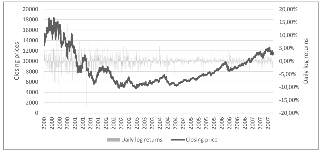
Figure 1. Daily logarithmic returns and closing prices of OMX Helsinki index from 3 January 2000 to 28 December 2007.

The OMX Helsinki (OMXHPI) is a share price index calculated on a daily basis. It consists of the 129 (as of 22 November 2013) traded stocks on the OMX Helsinki Stock Exchange which is a part of the OMX Group (Nasdaq OMX 2003). This particular index is used because of the liquidity problems and lack of the sufficient time-series with smaller indices. Logarithmic returns are calculated from the index as stated above and these returns are used throughout the paper. To introduce data, below in Figures 1 and 2 is presented daily logarithmic returns and closing prices of the index and in Table 1 basic descriptive statistics about the time-series.