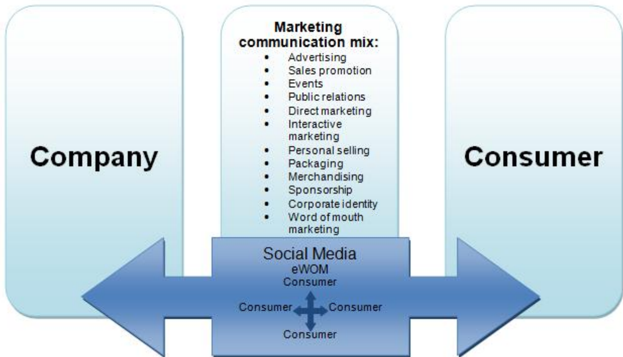
Figure 1. Research frame.

The research frame of the study conducted in this thesis is illustrated above in the figure 1. The research conducted studies how word of mouth communication and the evolvement of Social Media have influenced marketing communication in the case company. As the picture presents, there are three main elements in this research: company, marketing communication mix and consumer. Social Media is presented here as a part of marketing communication mix enabling bidirectional communication between the company and consumer. This research is conducted from company's point of view.